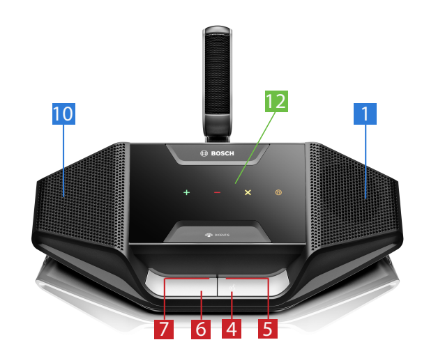
Figure 3.3: DCNM-DVT