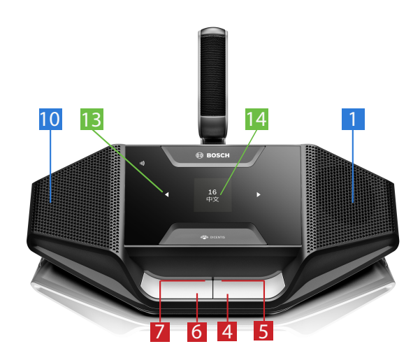
Figure 3.4: DCNM-DSL