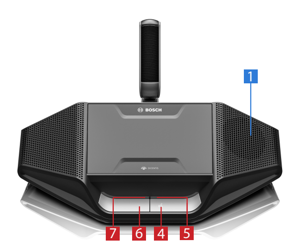
Figure 3.2: DCNM-D