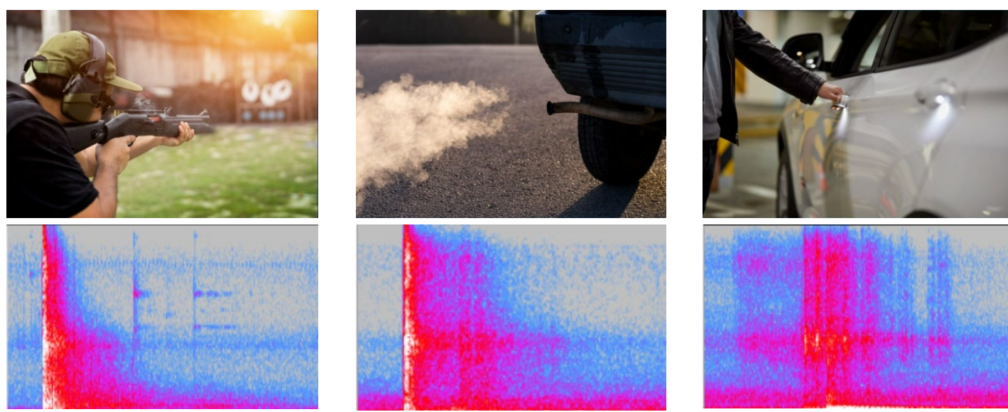
Figure 1: Similar sounds with different audio signatures

The spectrograms above are a visual representation of the audio signatures. The X-axis is time, and the Y-axis is the audio frequency. The intensity is represented by a color. The hotter the color temperature the louder the sound is at that point in frequency and time. The above signatures are clearly different, but most gun types have very similar signatures, yet they are different given the caliber and other specifications of the gun. This information all has to built into the data model.