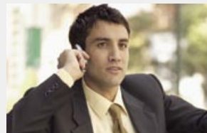
Remote system control and 2-way audio