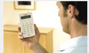
1000 m RF range in open field