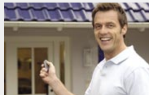
Operating with RFID tokens or key fobs