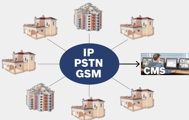
Alarm transmission over PSTN, GSM or IP-networks

The receiving station can even pinpoint the location of the alarm, providing immediate help. In the event of an alarm, a security guard can check the premises during users' absence with a guard code.