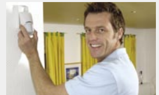
Stylish design and easy installation