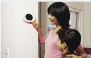
Voice interface in native language