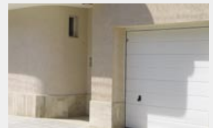
Comfortable control of garage doors, outdoor lights etc.