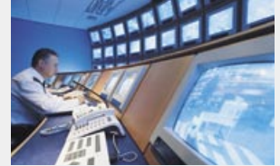
Central monitoring with PSTN, GSM and IP connectivity