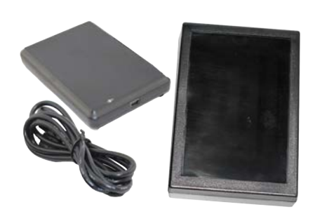
P/N - CM436B Desktop Reader Interface For 3rd party Weigand Readers. No Reader supplied.

P/N - CM438B USB powered Desktop Reader Interface for DF format EM Prox tokens.