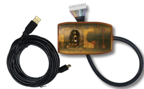
P/N - CM910B Combined Direct Link \Flash Programmer Interface - USB