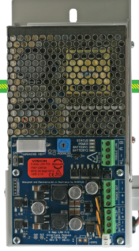
P/N - CM724B LAN 5 Amp P/S Module With Dual Battery Chargers (Export Model)

Some features and modules types may require panel and or module firmware updates to operate. Please see individual product documentation for minimum requirements.