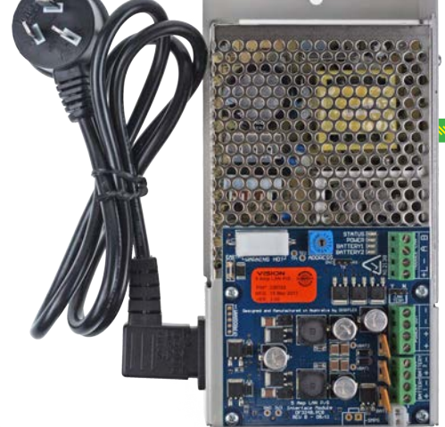
P/N - CM723B LAN 5 Amp P/S Module With Dual Battery Chargers

Desktop readers are for use with Solutionlink and Site Manager Software packages and allow user credentials to be learnt at the PC.