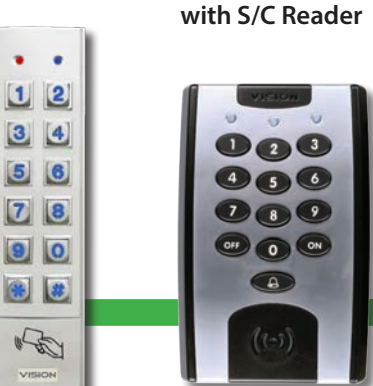
P/N - CP156B Slim Style External Metal Keypad with S/C Reader