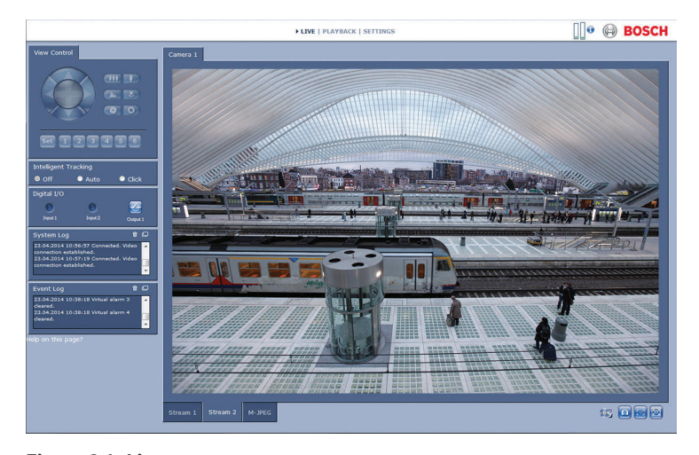
Figure 3.1: Live page

Other information may also be shown next to the live video image. The items shown depend on the settings on the LIVE Functions page.