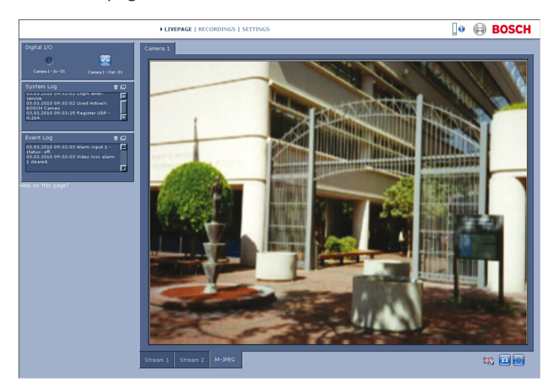
Figure 3.1: Live page

Other information may also be shown next to the live video image. The items shown depend on the settings on the LIVE Functions page.