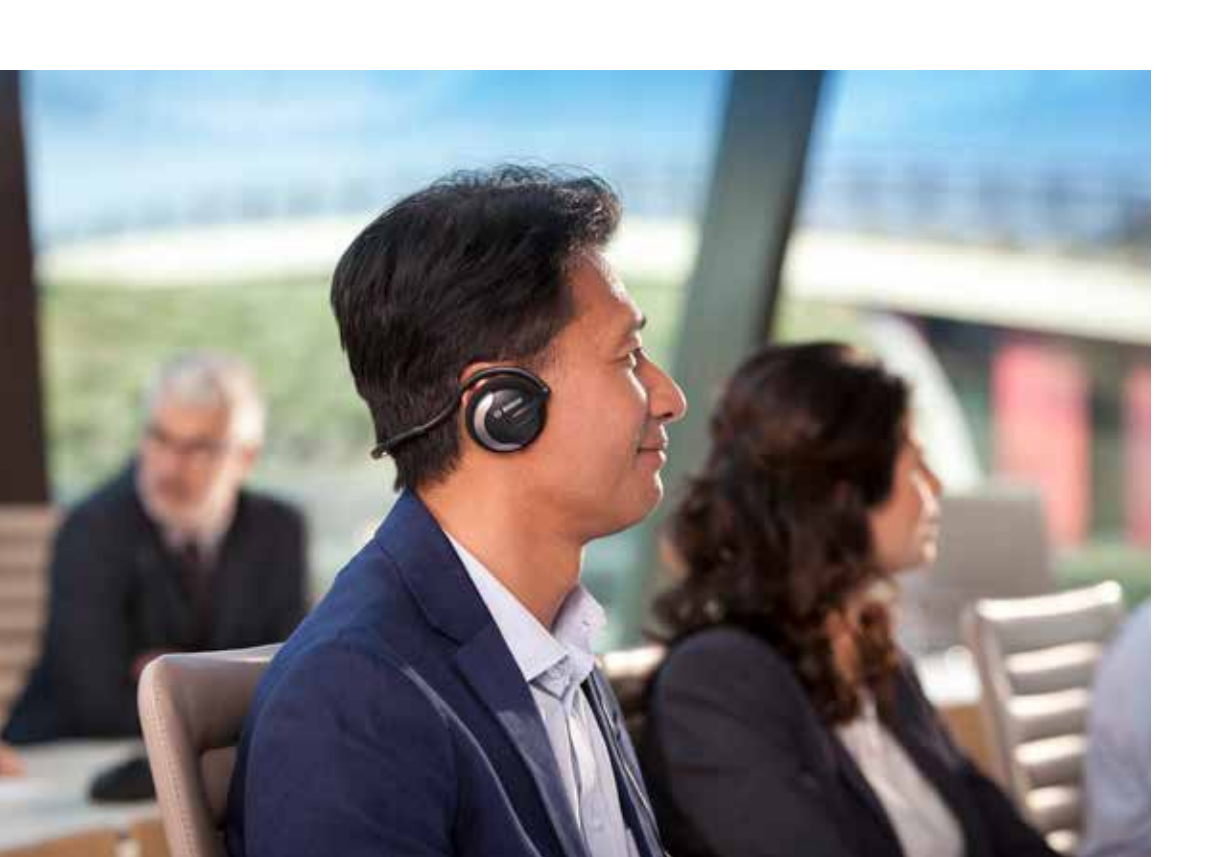
The microphone button(s) ensure intuitive (dual/ chairperson) participation

The DICENTIS Discussion device with language selector allows for dual identification and dual discussion, with one shared language selection.