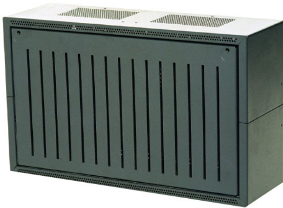
► Distribution box

The DIB 0000 A Distribution Box is equipped with a distributor rail compliant with EN 60715 and is used to install series terminals.