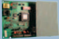
C900TTL-E Dialer Capture Module