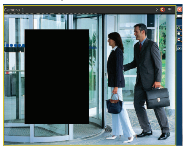
Fig. 2: Area masked by Privacy Zones feature

Privacy zones feature for masking sensitive areas within live images