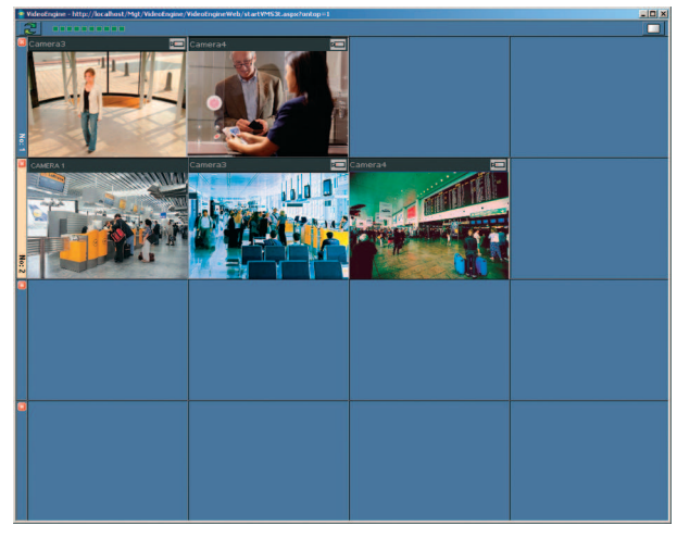
Fig. 1: Example of an alarm matrix with 2 active alarm situations