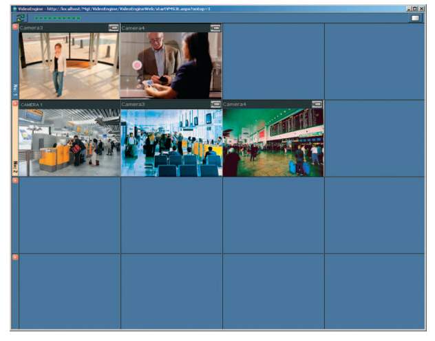
Fig. 1: Example of an alarm matrix with 2 active alarm situations