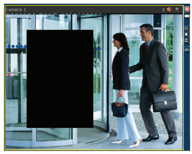
Fig. 2: Area masked by Privacy Zones feature

Privacy zones feature for masking sensitive areas within live images